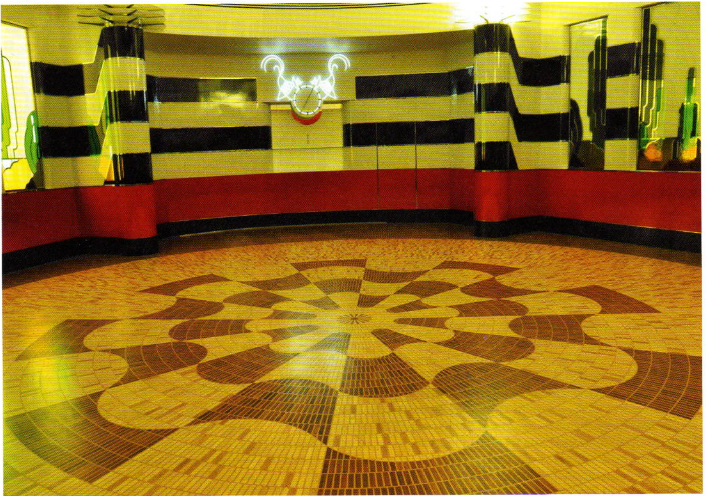
The restored 30s mosaic floor of the Titanic bar in the new Quadrant development off Regent Street and Piccadilly Circus.